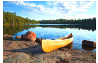
Canoeing and Kayaking