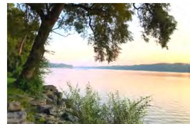
Hudson River from Cornell Park

some of the best CONVERSATIONS happen on road trips