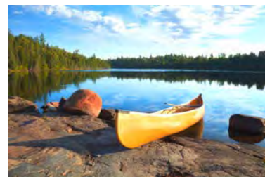
Canoeing and Kayaking