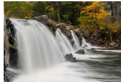
Four Mile Point Preserve

Scenic Hudson Valley, rolling hills, mountain ranges, sparkling lakes, waterfalls, wineries, farm-to-table dining, and endless nature trails for exploration. All of this in your own backyard.