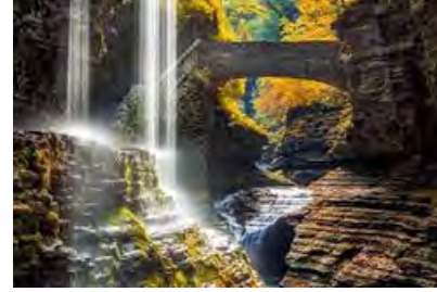
Falls on Treman trail