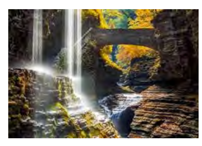
Falls on Treman trail

Scenic Finger Lakes, waterfalls, wineries, lakes, universities, farm-to-table dining, and endless nature trails for exploration. All of this in your backyard.