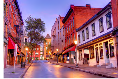
Saratoga Springs, NY