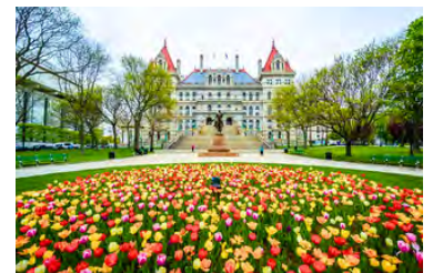
The Capitol District

some of the best CONVERSATIONS happen on road trips