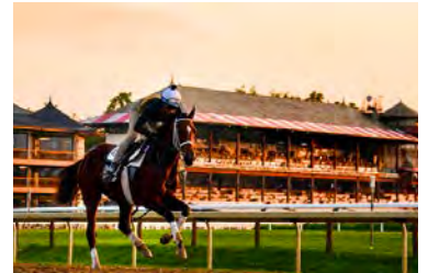
Saratoga Race Track