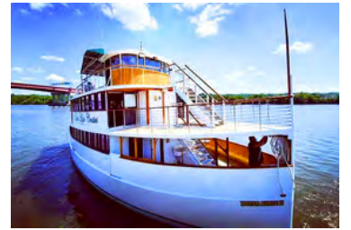
Hudson River Tours

You'd be hard-pressed to find a New Yorker who doesn't have a fond memory of their time in Upstate NY..