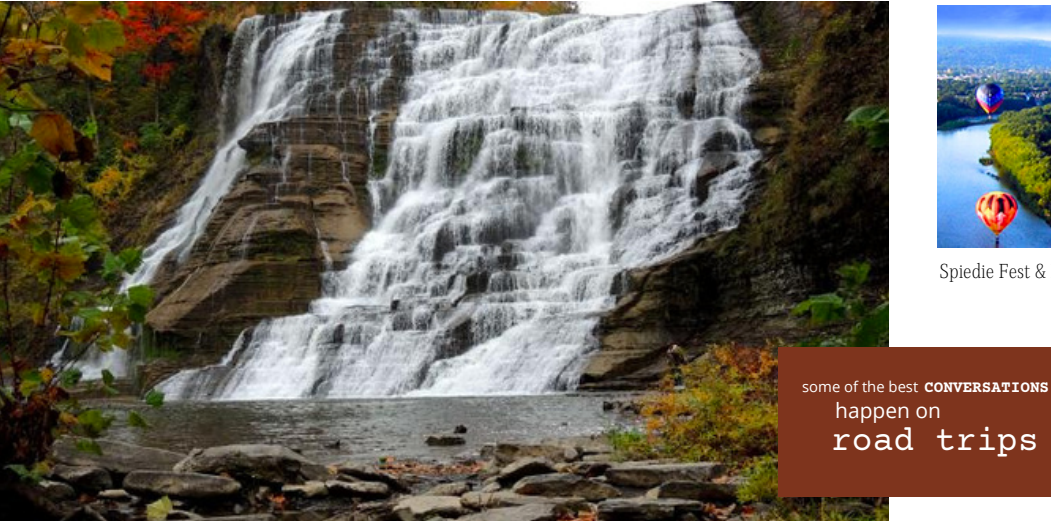
Spiedie Fest & Balloon Rally