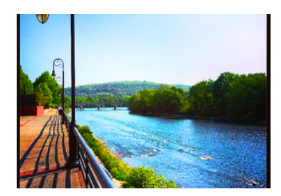
Binghamton River Walk