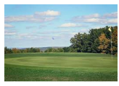
Ford Hill Country Club