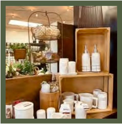
Cobra Marketside- Afton NY (8 Miles)

UHS Primary Care- Deposit UHS Delaware Valley Hospital Guthrie Lourdes Hospital UHS Wilson Medical Center